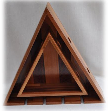
Wine bottle & Glass Holder