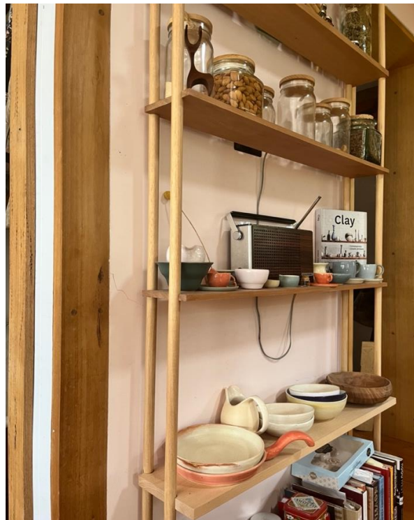
Wall Unit, Pottery and Woodcraft