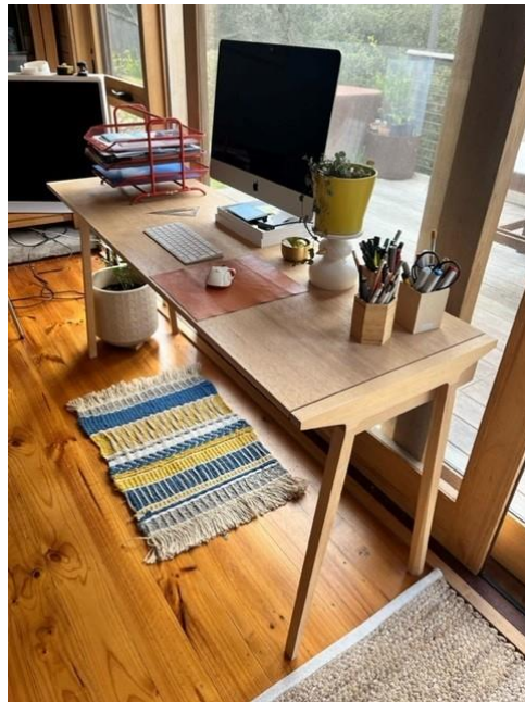
Desk and Rug