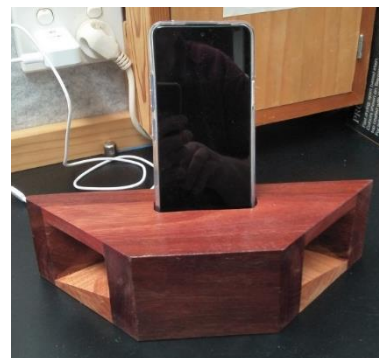
Mobile phone in reception.

This means the committee will need to reassess its Emergency Procedure to utilise AML.