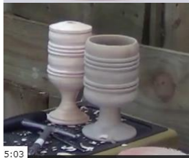
A lidded medieval goblet