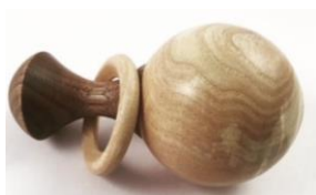
A baby rattle