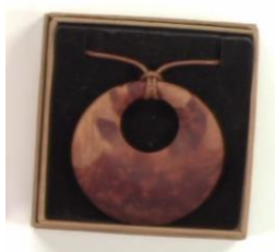
A variety of Pendants