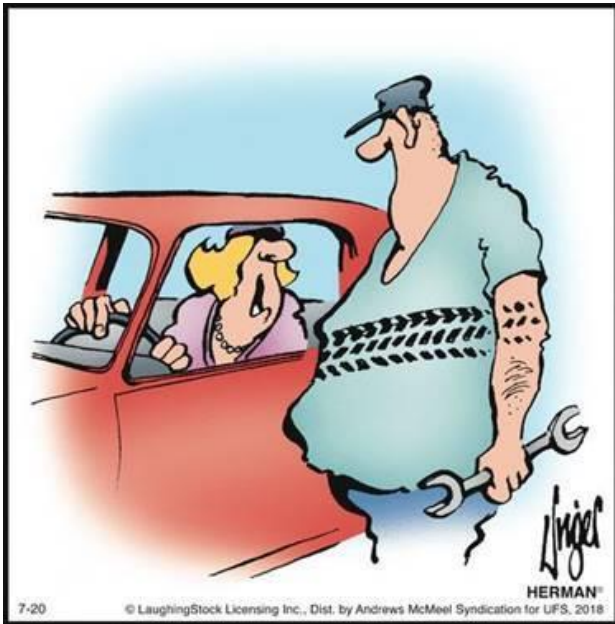
"I thought you were finished!"