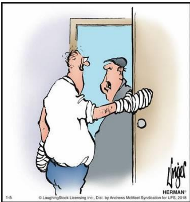
"You the guy with the hedge trimmer for sale?"