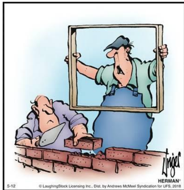
"Can't you work faster? My arms are killing me."