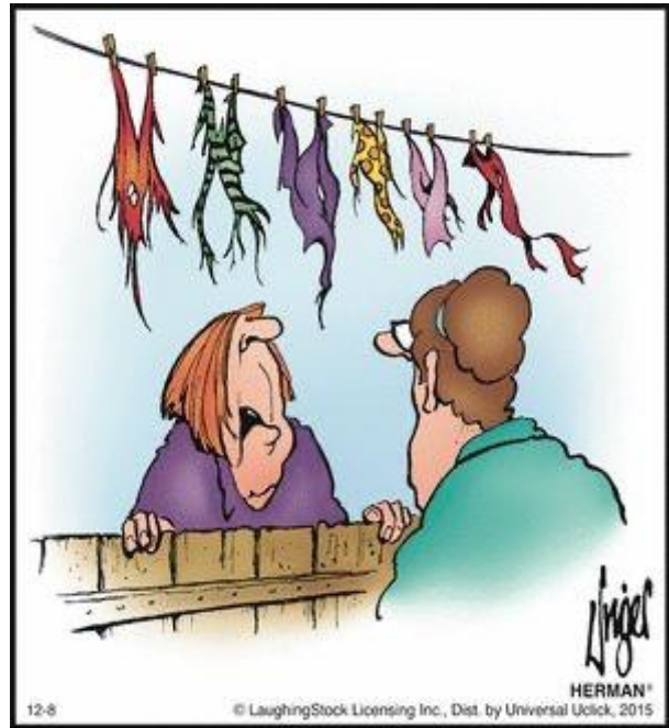
"As you can see, the genius fixed my washer."