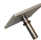
FIGURE 1 CAMLOCK TABLE

Before making any decision the committee would like feedback from members as to whether they think this is a good idea & they would use the tools.