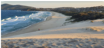
Forster New South Wales 2428

Carbatec have also offered to come out to our shed and conduct demonstrations, and advise on products. Alternatively they will do this instore and have a morning tea provided upon arrival.