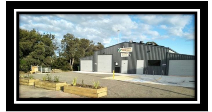
FIGURE 2 THE VERN WRIGHT RESERVE WORKSHOP

The club knew the Council would provide a new workshop but it would have to have sufficient funds to support the move. Fortunately the club was able to build up its reserves by attending to all the Bunnings