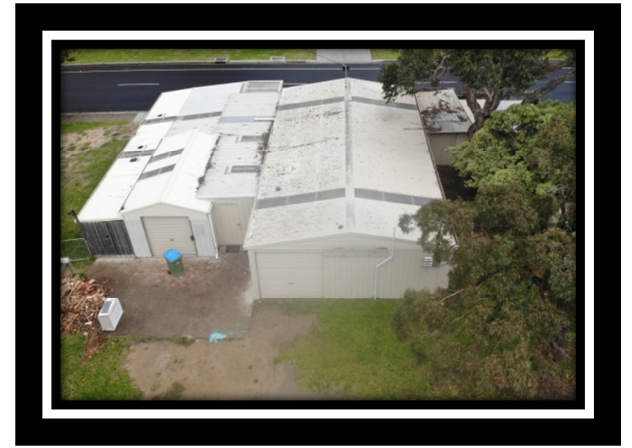
FIGURE 1 THE WOSP CLUBHOUSE ON DEPARTURE IN 2019

In June 2019 the Council handed over the keys to the new workshop & sessions began on August 2019.