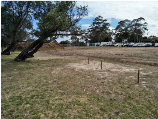
Figure 1 The trees have gone.

The process of relocation has started. The trees are down, the construction of a car park for 350 cars has commenced, the lease for the new club rooms for 5x5 years has been signed and contracts to start our new club house have also been signed. John Bayliss & Greg Millar are involved in representing the club interests for the new building and the relocation planning.