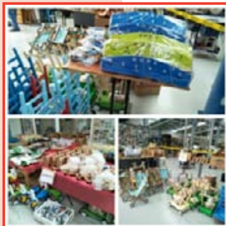
Some of the 750 toys