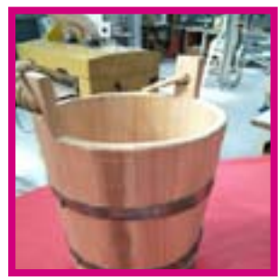
The Smithwick Bucket