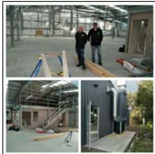
New workshop taking shape

All members will need to be oriented with the new environment. There will be an emphasis to appreciate where machinery and tools are located, eg, the woodturning chisels may not be located as close to the lathes as they are now. New procedures to