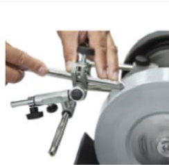
Figure 3 Multi Jig