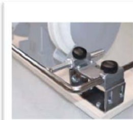
Figure 4 Gouge turning Jig

The Tormek Sharpening solution recommended by CWS assumes you have a grinder with the appropriate grinding wheel. It requires a protractor & 3 jigs, the base (A$200), the gouge turning jig (A$206) & the multi jig (A$144). The gouge turning jig is required for all the gouges & the multi jig is used for the various skews & scrapers.