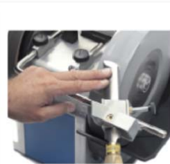
Figure 5 Base