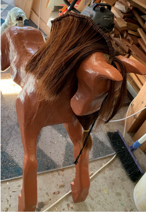
Figure 4 Anne Miller's Painter Horse