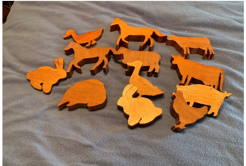
Figure 3 Anne Miller's Farm Animals