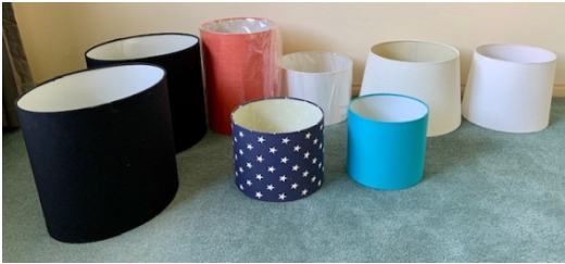
Figure 6 Josie's Lampshades Available Free