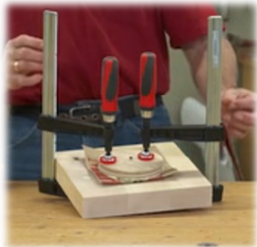
Figure 2 Add a sacrificial base to a blank. (paper joint)

An inexpensive solution can be to use a paper joint. A paper joint is a temporary joint that attaches a sacrificial base to the bowl so that the screws from the faceplate will not penetrate into the bowl. The joint will hold the blank securely while you turn your project, and the temporary base is easily removed when the turning is complete.