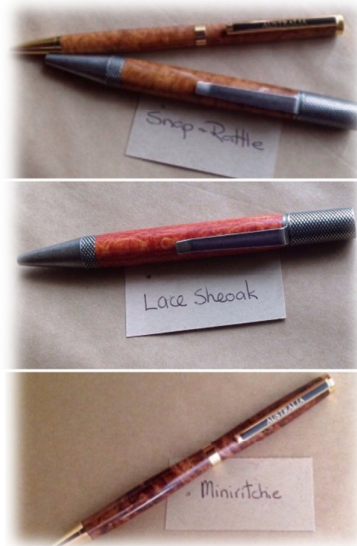
Figure 1 Jose Mare's Pens

While it was known the quote did not contain GST or freight the cost was probably a bit more than expected. GST was 10%, but the freight cost from Australia Post proved to be about 1/3 of the cost price. As an example a pen blank quoted as $3 had a final cost price of $3.85